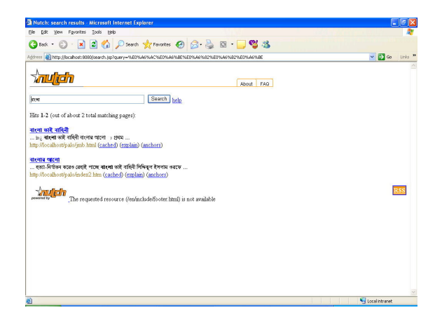
Figure 2: Search results being displayed